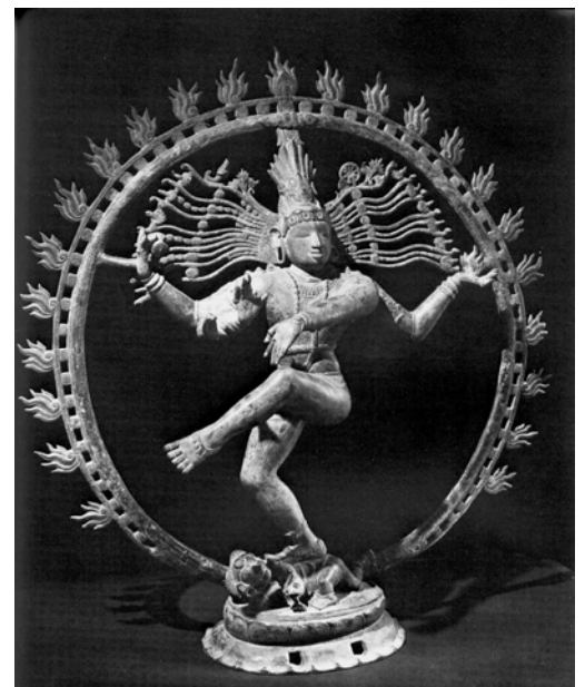
Figure 6: Shiva as Lord of Dance (Nataraja). India (Tamil Nadu), Chola period, c late 11 th century. Copper alloy.

The Hindu god Shiva carries a trident; he often has a serpent flung around him as a scarf and wears a skull and the crescent moon in the matted locks piled high upon his head. A third eye in his forehead signifies his all-seeing nature. Renowned as the great dancer, Shiva has