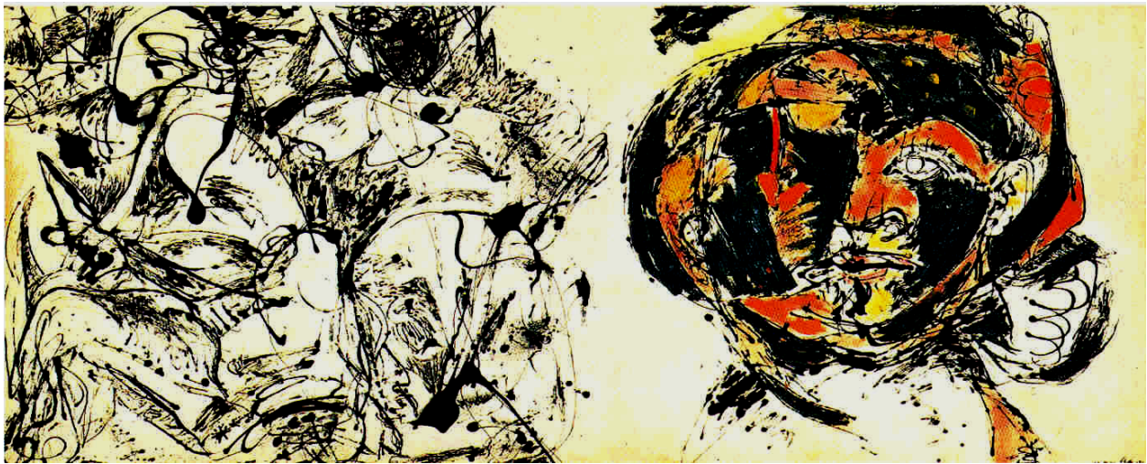
Pollock combined two methods of painting in Portrait and a Dream (1953). He used oil and brushes while the canvas was upright, then moved to the floor to pour enamel.