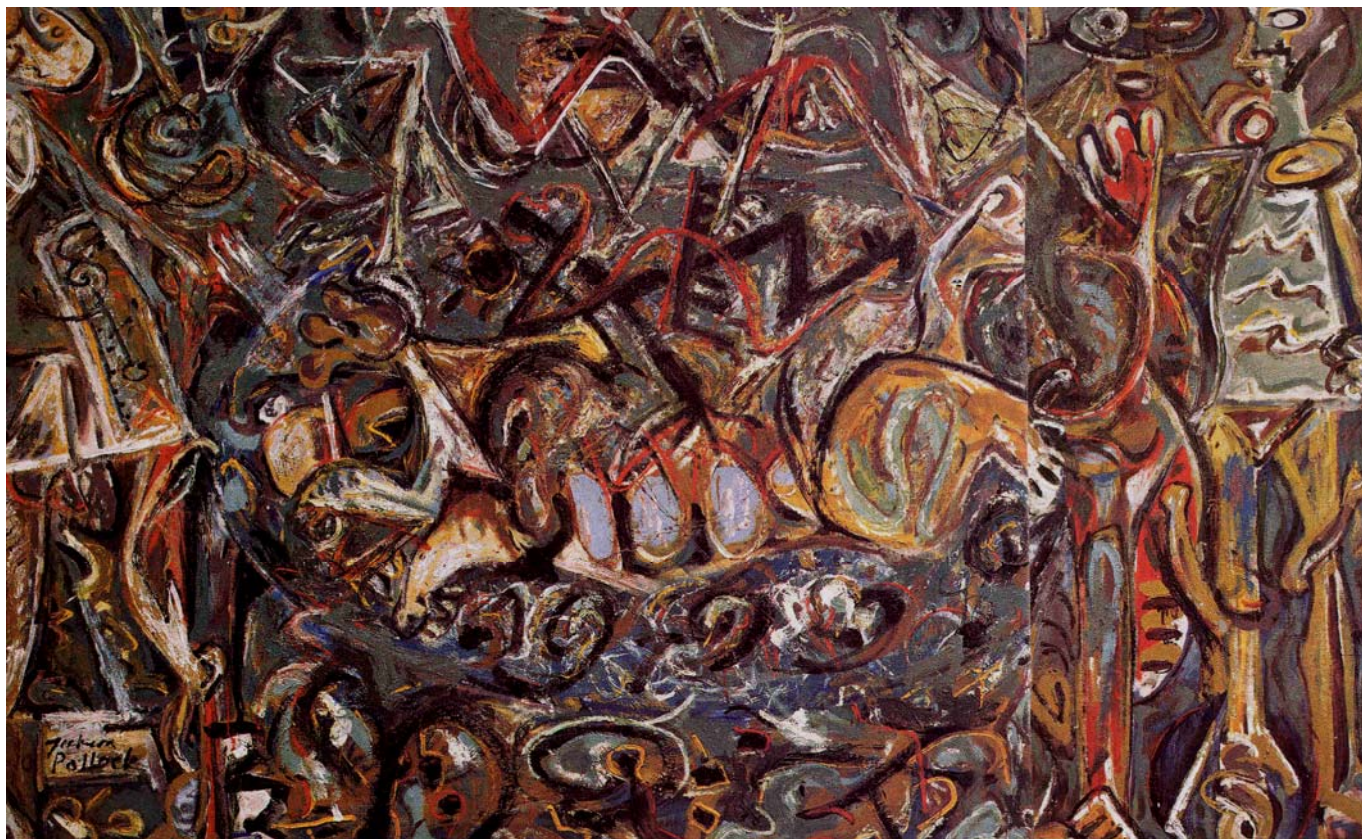
Totemic forms flank an ovoid beast bearing a stick-like figure in Pasiphae (1943). Though it references the tale of the Minotaur, its fragmented imagery borders on abstraction.

Krasner, the sixth of seven children raised by Russian-born Orthodox Jewish parents in Brooklyn, truly did know everybody. Introducing her new companion could be an adventure, however. Having been told that Pollock "worked from his heart," Hans Hofmann suggested that he come to his school and work directly from nature. "I am nature," replied Pollock, as if he were Prospero in Shakespeare's Tempest .