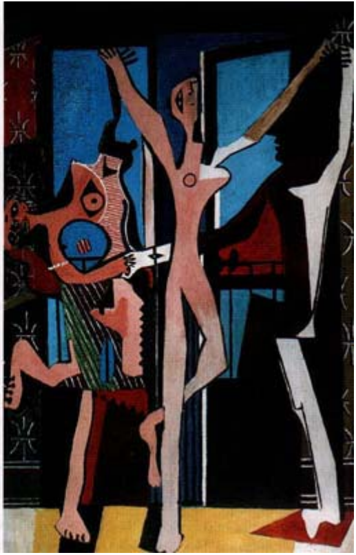
A picture within a picture, Matisse's 1912 Nasturtiums with 'Dance' II (left) links the dancers' vitality to the life of the flowers. The violent energy and the "convulsive beauty" of Picasso's 1925 The Three Dancers caused the Surrealists to call him one of their own.

Matisse had nearly a decade of radical painting under his belt in 1906, while Picasso was just emerging from his blue and rose reveries, and about to explode into Cubism. Matisse was the leader of the "fauves," or "wild beasts," as they were known, for their use of "brutal" colors. "All they give us in the way of sunlight," a critic carped of Matisse's paintings in 1906, "is trouble with the retina." Matisse's companion in creating fauve landscapes, André Derain, later recalled their sense of artistic violence. "Colors became sticks of dynamite," he said. "They were primed to discharge light." Matisse, more gently, said that he was finding out "how to make my colors sing."