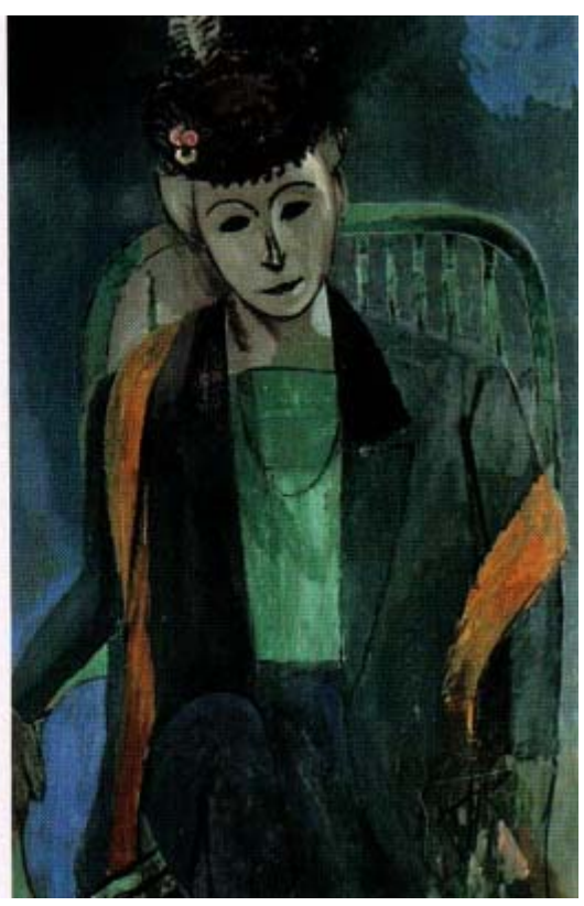
In its format, subject (woman in an armchair) and similar details (hats, scarf and feather boa), Picasso's 1914 Cubist Portrait of a Young Girl (left) can be viewed as a playful response or retort to Matisse's 1913 Portrait of Madame Matisse. With its African masklike face, Matisse's severe, nearly abstract portrayal of his wife created a sensation at the 1913 Salon d'Automne.

The two painters were well versed in the art of the past, and both were seeking ways to escape its influence when they met circa 1906. The meeting was arranged by the American avant-garde writer and expatriate Gertrude Stein, who, with her brother Leo, had daringly begun collecting Matisse's new paintings when almost everyone else in Paris was laughing at them. As a writer, Stein was rearranging English syntax into new forms that seemed an outrage to all good sense. No wonder she loved Matisse's defiantly crude figures and wild colors, affronting the canons of beauty and sensibility.