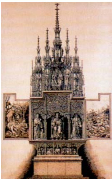
A 1905 drawing shows how the altar may have originally looked, with wings open.

The altarpiece's move to Colmar had already awakened interest in Grunewald and his work. A policeman who liked to delve into art history in his spare time proved that the paintings were the work of Grunewald and not Durer. Later scholars shed light on Grunewald's identity. But it was not until the novelist Huysmans published his passionate praise at the turn of the century that word spread throughout Europe of the altarpiece's value and uniqueness.