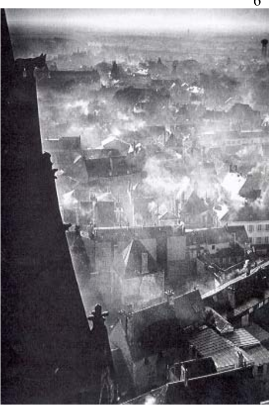
Chartres Cathedral in Winter (1946).

Brassai's 1961 publication of a book on graffiti marked the diminution of his interest in the still camera. He made a film about animals that won a prize at the Cannes Film Festival, and turned his attention to drawing, sculpting and especially writing. To the end, he continued to chronicle the place and the age in which he lived, "to breathe it in," and "probe it with eyes and hands."