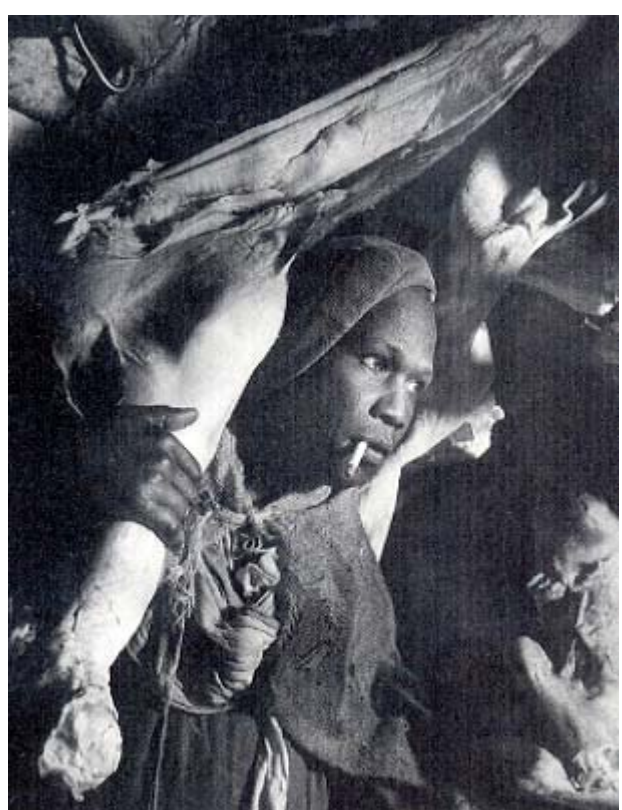
Brassai sought out scenes that conveyed the special character or atmosphere of a place. Porter at Les Halles Market (1935).

But the ruling icon in Brassai's life was Picasso, particularly during World War II. The City of Light was blacked out every night, and Brassai took care to document this melancholy predicament. But paper and film were in short supply, and after France fell in 1940, he had to receive authorization from the Nazis in order to work. Getting a permit would have meant agreeing to collaborate with the Germans, which he refused to do. In a Paris of rationing, curfews, propaganda, arrests and executions, those who remained endured privations together and looked to each other for courage. Picasso's resolve bolstered Brassai's own. Because Brassai had no magazine jobs, his money was vanishing. (At one point he was forced into hiding because, as a Romanian citizen, he was subject to conscription by the Germans. "I preferred desertion," he declared.) Picasso came to the rescue in 1943 by asking him to photograph his sculpture for an intended book. Brassai labored in the artist's unheated studio in an overcoat, scarf and hat; the winter was so cold that Brassai's pet fish froze in its bowl. After his sessions with Picasso, the photographer wrote up their conversations. The notes became the basis of Picasso and Company, a book that has become a