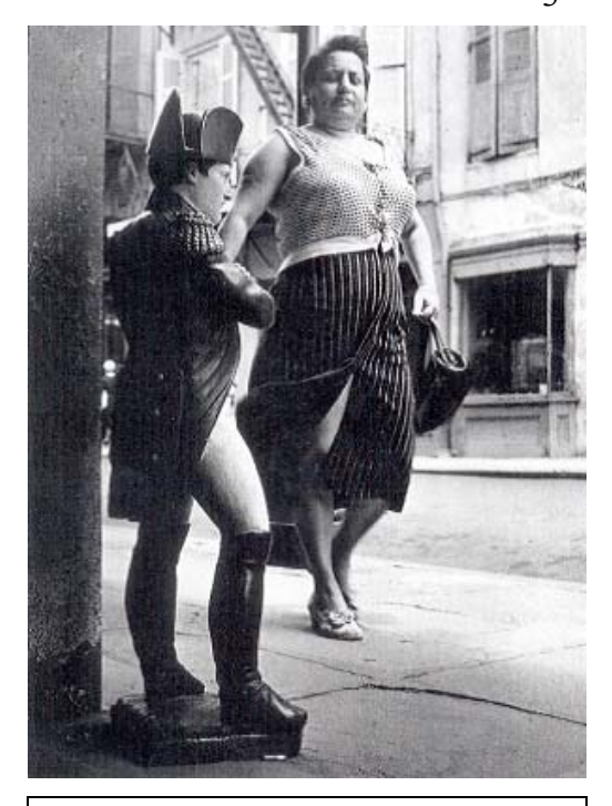
Brassai shot this amusing take of a pedestrian passing a statue of Napoleon outside a New Orleans antiques shop in 1957.

hours, praying for someone to come along and pick up the tab.