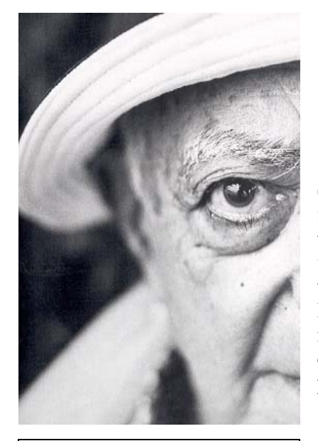
For three decades, Brassai's penetrating eye—captured in French photographer Andre Villers's 1981 portrait—focused on the urban landscape of the City of Light.

Paris de nuit established Brassai's place in photography immediately and irrevocably, but such a dominating achievement also tended to obscure his versatility. Brassai never restricted himself to one subject, theme or genre. For the next three decades, he pointed his lens at the whole spectrum of humanity across Europe and the United States, creating some of the most compelling images in 20th-century photography. The scenes of "Paris at night, however significant,